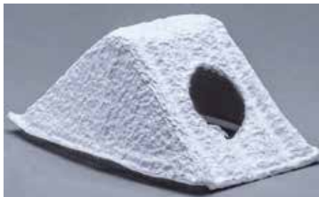
L 6" x W 4" x H 2.5"