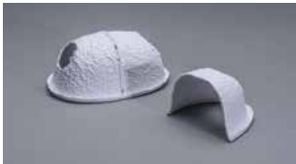
L 6" x W 3.5" x H 2.25"