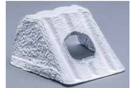
L 4" x W 4.25" x H 2.25"