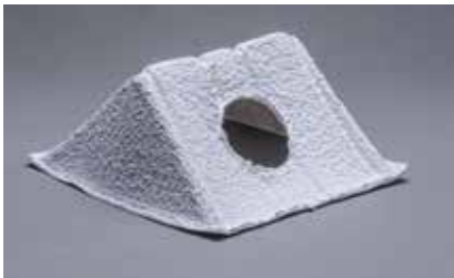
L 8" x W 7" x H 3.75"